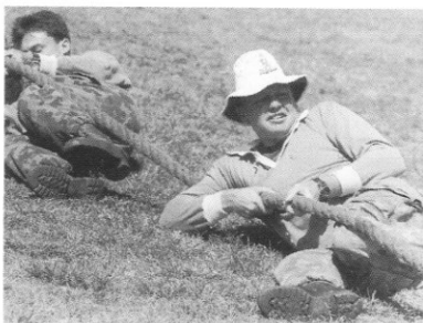
The very relaxed C Coy Tug 'o' War team.