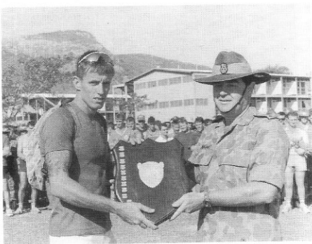
CPL Brown accepts the NQ Area Cross Country Champion Trophy from COMD 3BDE.

Well done to all those who participated in Cross Country running this year especially those who put in the extra effort to be selected to represent the Bn.