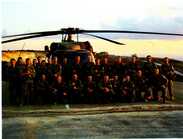
12 Platoon guard the Blackhawks at Balibo