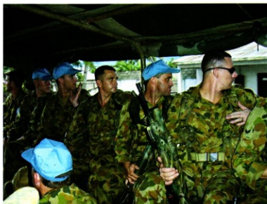
The section commanders take in the surrounds of Dili during the Relief in Place