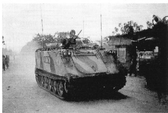
A mounted infantry section patrols the streets of Baidoa.