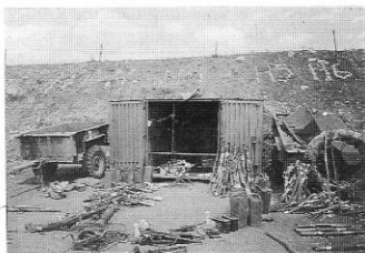
A portion of the weapons captured during Op Solace.