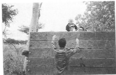
'Oooh, that looks mighty steep!'

We look forward to an even better year in 1994 and will enjoy welcoming more ladies into the association. We wish all the ladies and their families leaving a fond farewell. To those ladies staying you are invited to join us next year.