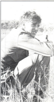
"No change.... over"

Thanks to all for a good year in '87. To all ranks and their families, well done and all the best in '88