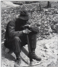
Pioneer at rest