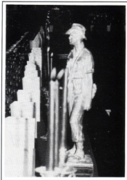
This silver soldier stands guard over the waiting table. The cutlery and glasses stand in obedient lines before him.