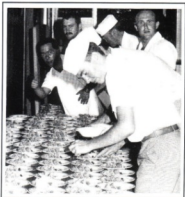
"...The Engine Room"