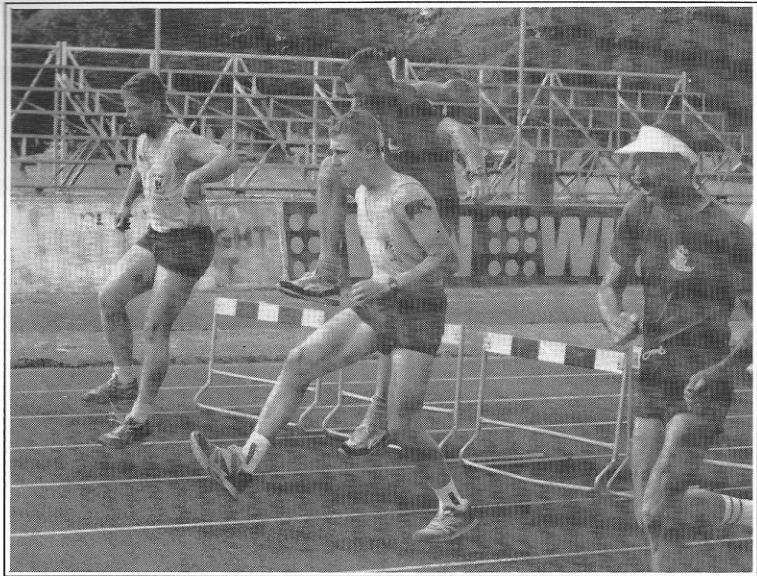
The Veterans' Steeplechase