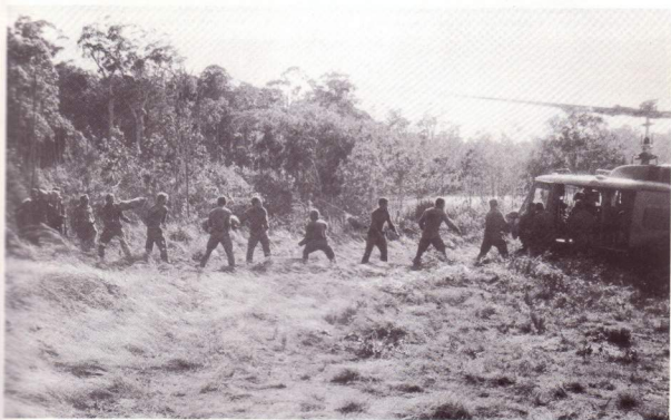
Resup at Paluma