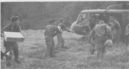
Top: Company Q Staff load a maindein at Eagle Farm helipad.