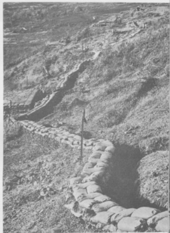
RIGHT: Part of the Horseshoe defensive position.