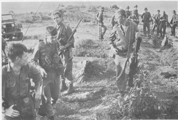
Ready for a patrol from the Herseshoe.