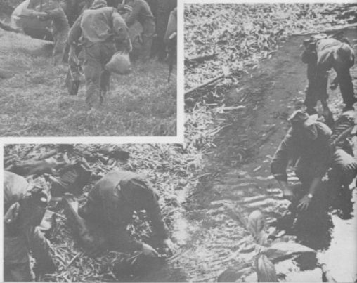
RIGHT: Company headquarters refills its waterbottles.