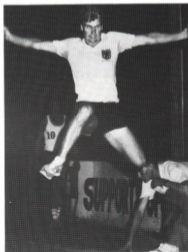
UP, UP and Away!