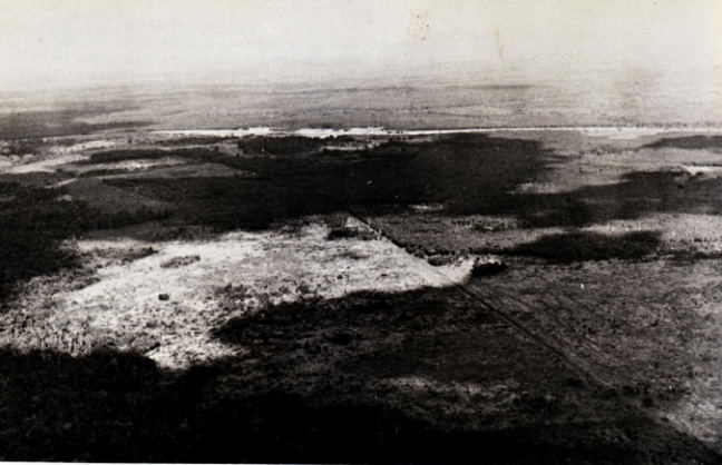
South of Courtney astride Route 2, scene of much VC resupply activity.