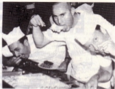
"... and we eat it"