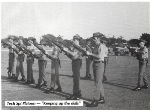
Tech Spt Platoon — “Keeping up the skills”