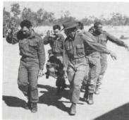
Everybody was exercised during KB6.