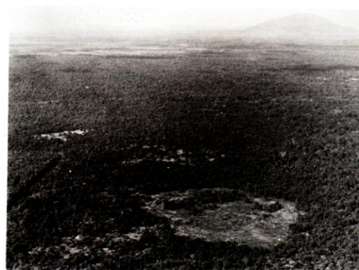
AO of Operation OVERLORD.