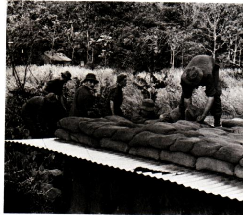
Pioneers at Trish.

Results: Own Troops — 1 WIA Enemy — 1 KIA