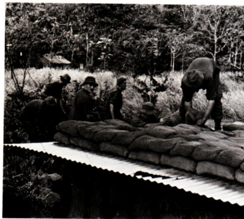
Pioneers at Trish.

Results: Own Troops — 1 WIA Enemy — 1 KIA