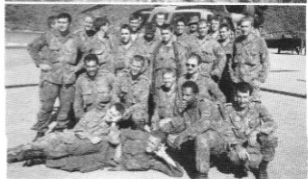
The platoon trying to hide a Blackhawk