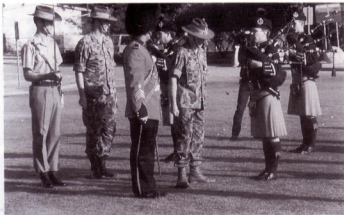
The new CGS inspects Pipes and Drums