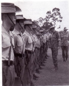
"Hmmm, I wonder if the height restriction policy should be reviewed?"