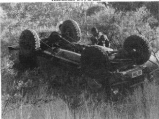
"That's what happens if you hit 2 kangaroos!"