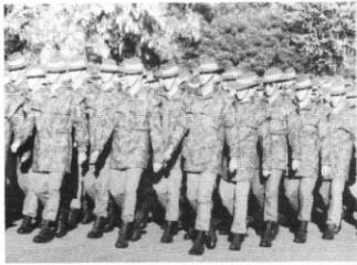
Raincoats on Parade