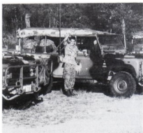
PTE Molineux at work!