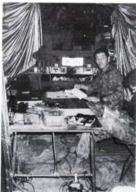
The Führer Bunker