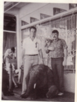
The trick is pick the monkey and the elephant