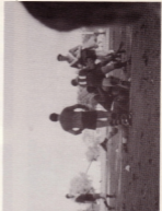
Flaggy League Action