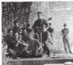
A sing-a-long after the Joint Exercise