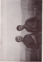
The OC and his faithful Sig