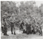
Hot box meals are the same the world over