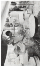
18. Dances from Malaysia style