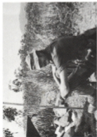
17. People can see the funny side of things