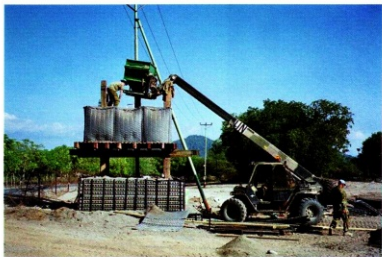
Above: Engineers use the Big Green Thing to fill baskets at the new Aidabaleten Company site