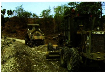
The TransPlants from Engineers move mountains to build roads.