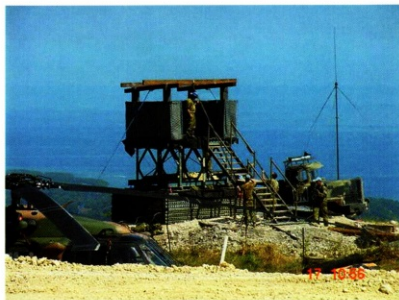
The Sappers constructing a strong point with the best view in Timor