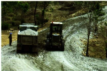
Sergeant Patchett supervising the construction of Route Monsta