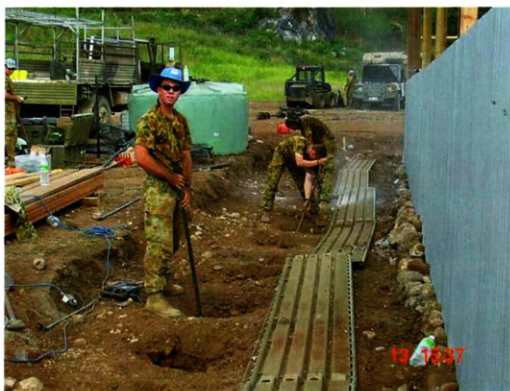
Engineers impersonating wombats as they prepare to revert the new Junction Point Memo accommodation building