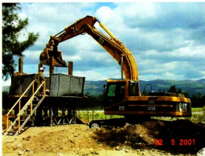
The Engineers use their excavator to fill the Flexmac baskets on the strongpoint at Junction Point Bravo