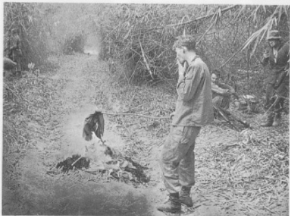
The enemy has been buried and his clothes and belongings are destroyed on a fire. Time to relax, but not too much. Charlie may be still be there.