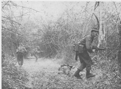
"Quickly! Get up here. Where's the MSG?"

The following photographs are of soldiers of 4RAR/NZ(Anzac)Bn fighting the enemy. They are of men in action. They graphically portray the moment to which every member of the battalion stayed constantly attuned, the moment when the stillness of the jungle was rent by the strident, "CONTACT, CONTACT, CONTACT .....!"