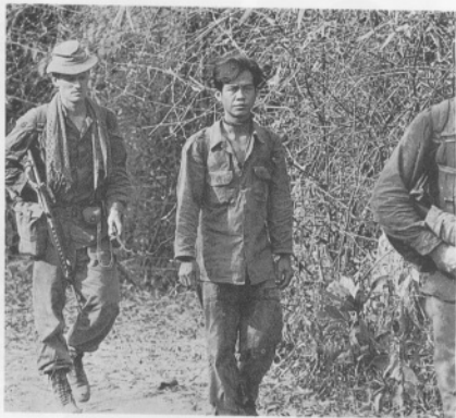
Vanquished, the Viet Cong is led away, to interrogation and a prisoner of war camp.