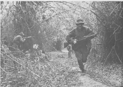
"Don't panic. We've got him beaten. If there are any more around they'll get the same treatment."