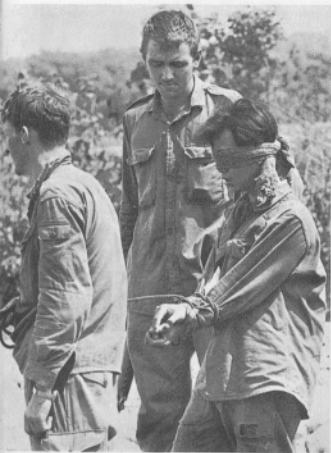
"Away you go boy. You're lucky. You're alive."