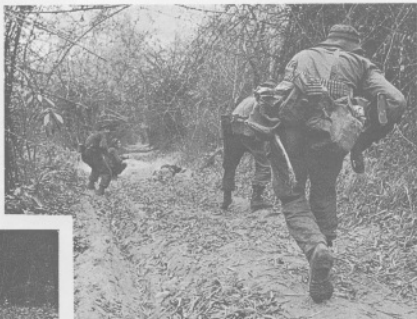
The M60 gunner runs to a new position.