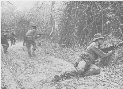
"Get into position and watch your arc. He's there all right."

The following photographs are of soldiers of 4RAR/NZ(Anzac)Bn fighting the enemy. They are of men in action. They graphically portray the moment to which every member of the battalion stayed constantly attuned, the moment when the stillness of the jungle was rent by the strident, "CONTACT, CONTACT, CONTACT .....!"