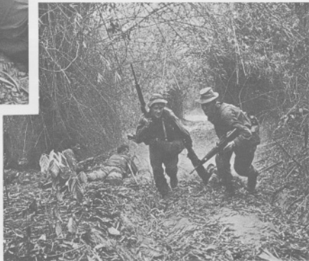
"Get this body out of the way, we'll search it later."