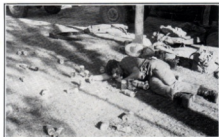
The unknown signaller