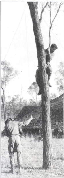
LCpl Burger and Pte Reynolds organising some communications

Signals Platoon worked well and played hard in 1987. Good luck in '88.