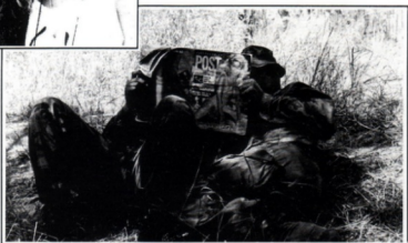
Two snipers reading the latest training pam.