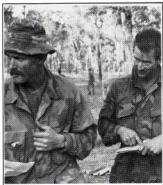
The men at the top

I would like to thank Recon PI for 2 top years. Remember this men, at a time when the PI had people on the DGC and marching into SASR, we were the only ones to pass all objectives of the ODF test. In terms of getting there and getting the job done, there were none finer than Recon PI in '87.