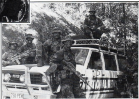
Recon Platoon have been found alive and well