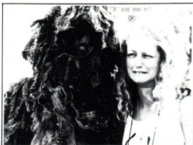
This lady has just won third prize in the Spt Coy Raffle